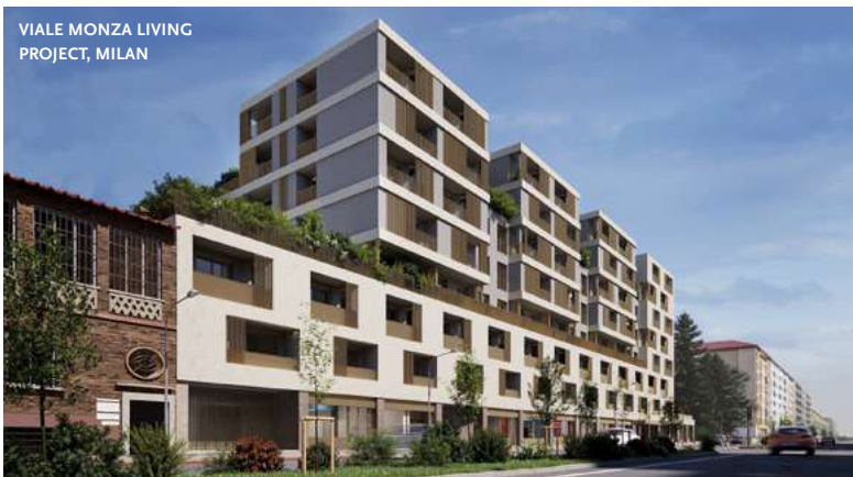
VIALE MONZA LIVING PROJECT, MILAN

Harrison Street was one of the first global investment managers to enter the European alternative property market in 2015, when its debut European fund took a pioneering approach by focusing exclusively on student housing. Two years later the Chicago-based