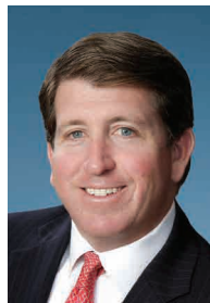
SPONSOR HARRISON STREET

Further, these highly fragmented asset classes generally have short-term leases, which allow rents to re-price more frequently in today's inflationary environment. This has resulted in a